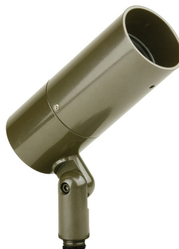
Shown in Bronze Powder Coat Finish (BZ)