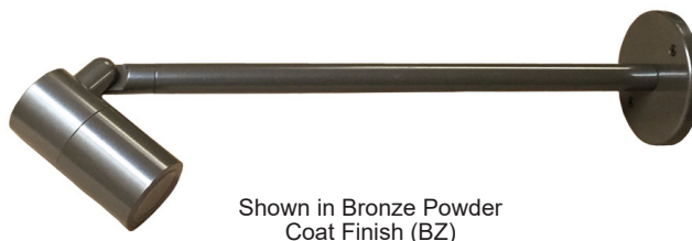
Shown in Bronze Powder Coat Finish (BZ)