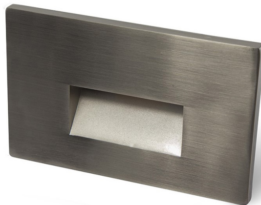
Shown in Brushed Nickel Finish (BN)