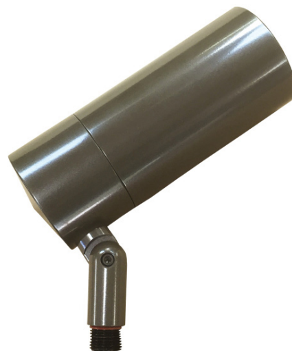
Shown in Bronze Powder Coat Finish (BZ)