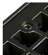
'Hot-Aim' Adjusting Screw