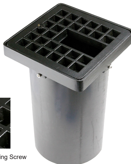
Shown in Black Powder Coat Finish (BK)