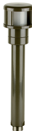
Shown in Bronze Powder Coat Finish (BZ)