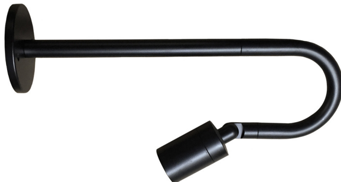
Shown in Black Powder Coat Finish (BK)