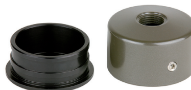
Standard two piece base for easy installation.