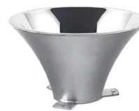
60° Wide Flood