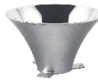
60° Wide Flood