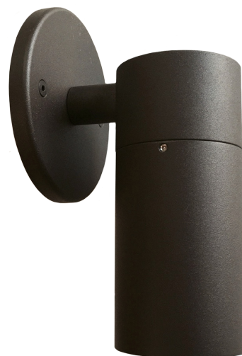
Shown in Bronze Texture Powder Coat Finish (BZT)