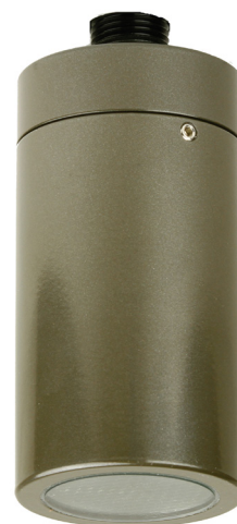
Shown in Bronze Powder Coat Finish (BZ)