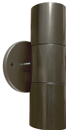
Shown in Bronze Powder Coat Finish (BZ)