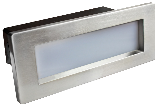
Shown in Brushed Nickel Finish (BN)