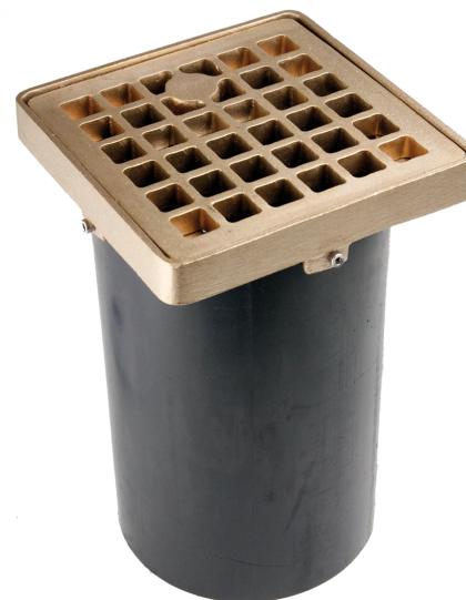
Shown in Natural Bronze Finish (NT)